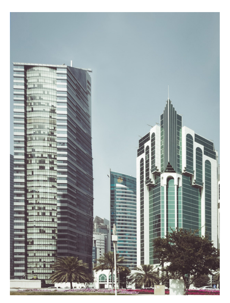
The ministry building in West Bay Doha's district.

FBA Gomyl engineers worked closely with the structural engineers of the building to find out the limits of weight and then to work out a solution by installing a SafeAccess monorail on the sloped part of the building. For the recessed areas, a fixed pantograph of 2m reach has been designed. The BMU is equipped with a knuckle boom to reach all facades of the building.