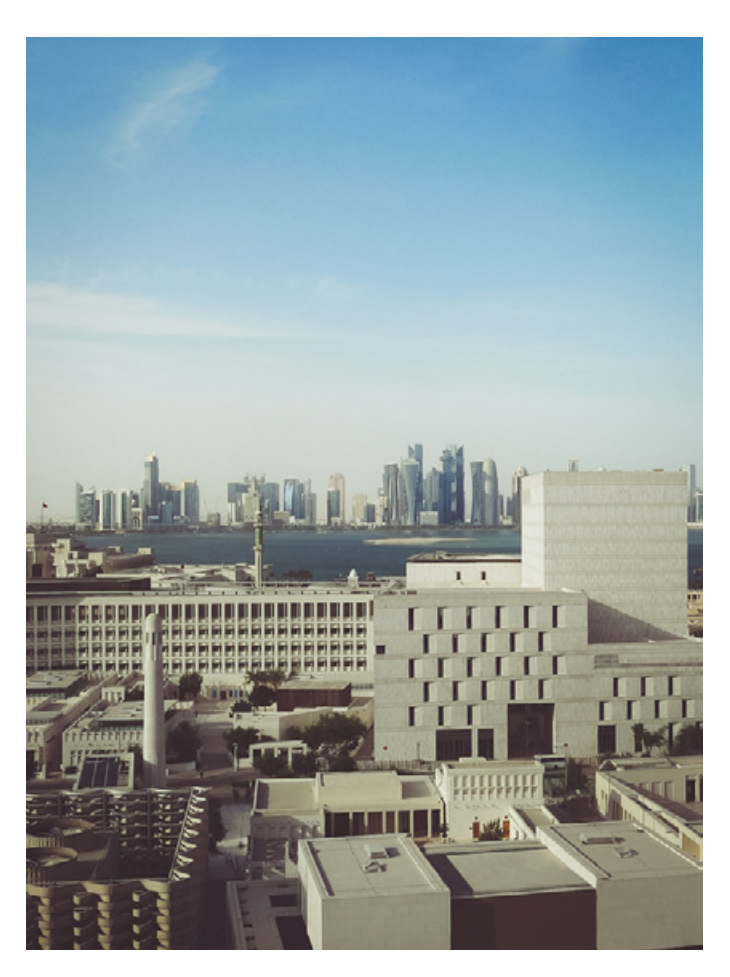
Reformed old commercial district in Doha, Qatar.

Design, engineer and delivery the equipments for the maintenance of 35 buildings corresponding to phases 1, 2 and 3. The access strategy has to achieve the following activities: cleaning of glazing wall, cleaning of metallic elements, glass replacement, infrequent safe access for inspection, cleaning of stone render wall and general maintenance.