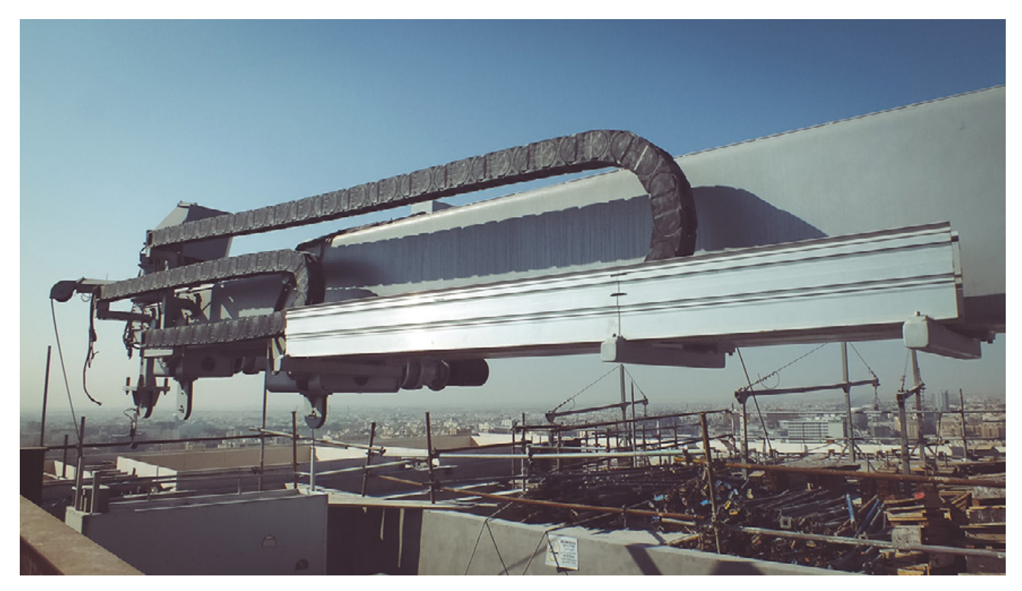
\label{prop:special} FBA\ Type\ S-T08: BMU\ with\ Telescopic\ jib\ with\ spreader\ bar\ in\ parking\ position.