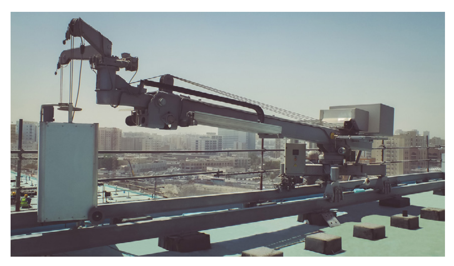
\label{eq:FBATypeS-S03:BMU} FBA \ Type \ S-S03: BMU \ with \ telescopic \ jib, \ slewing \ arm \ and \ auxiliary \ hoist.