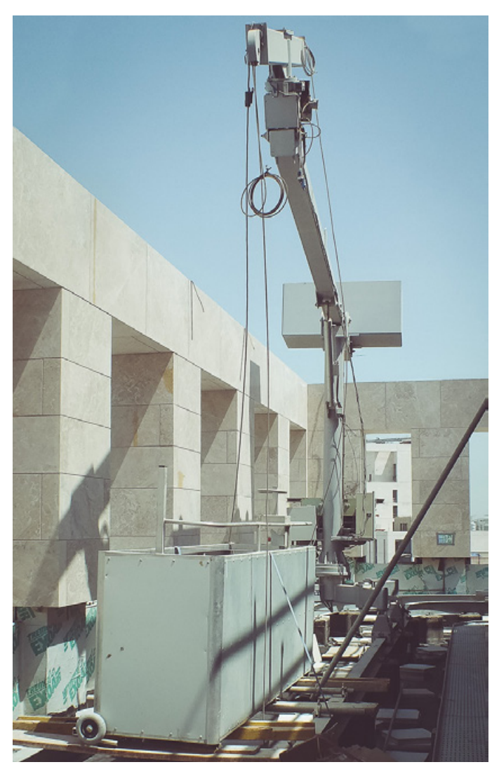
FBA Gomyl BMU Type 1 - U06 with one jib.

Cable lifeline type SecuRope Approximately 10.000m