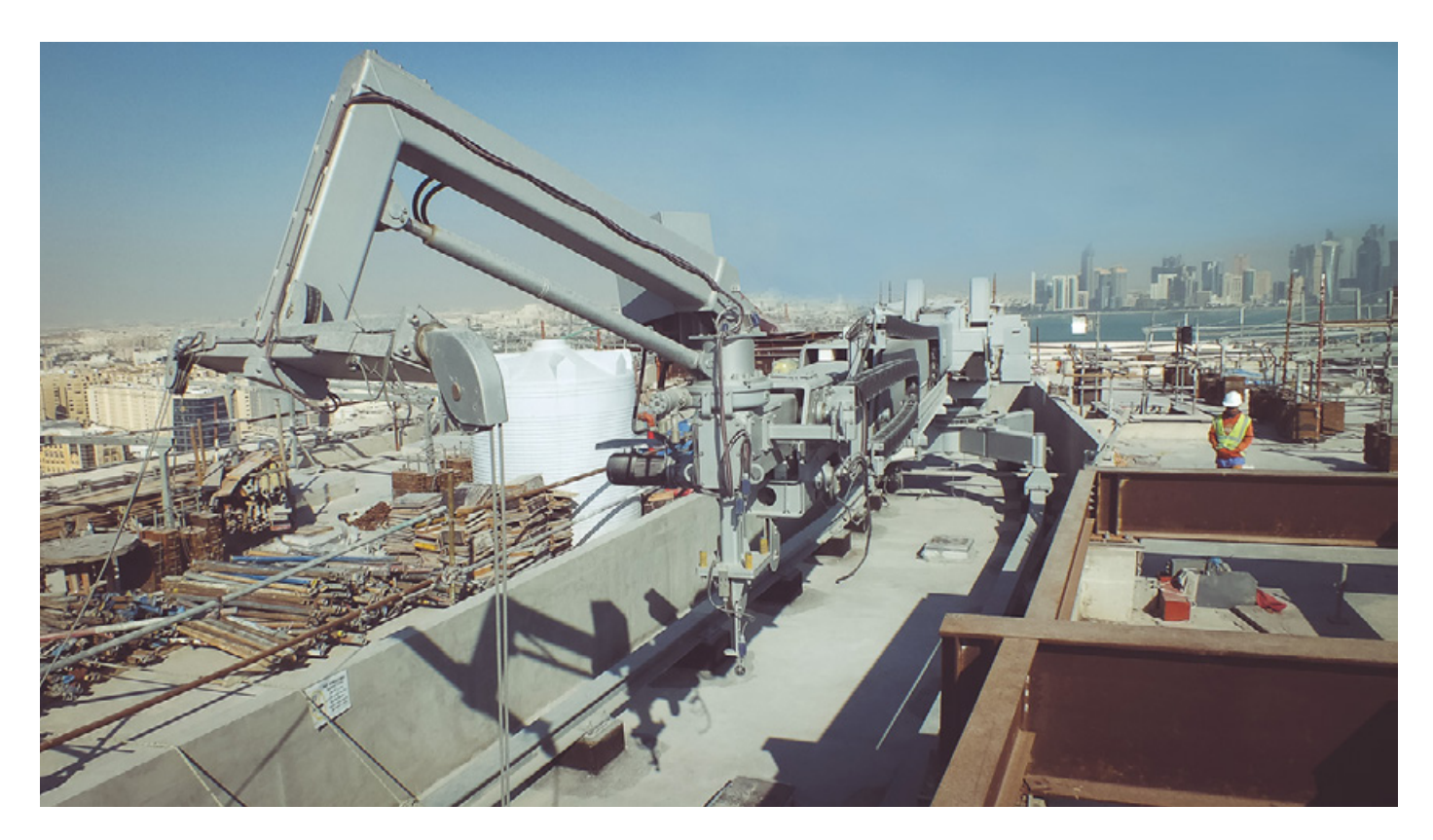
FBA Type S - T08: BMU with Telescopic jib, slewing arm, luffing device, luffing spreader bar, telescopic mast -scissor type- and auxiliary hoist