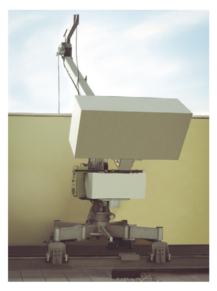
FBA Gomyl BMU Type 1 - U07 with one jib.

Where canopies restrict access for Davit arms from roof level, motorised monorail systems are integrated into canopy soffits.