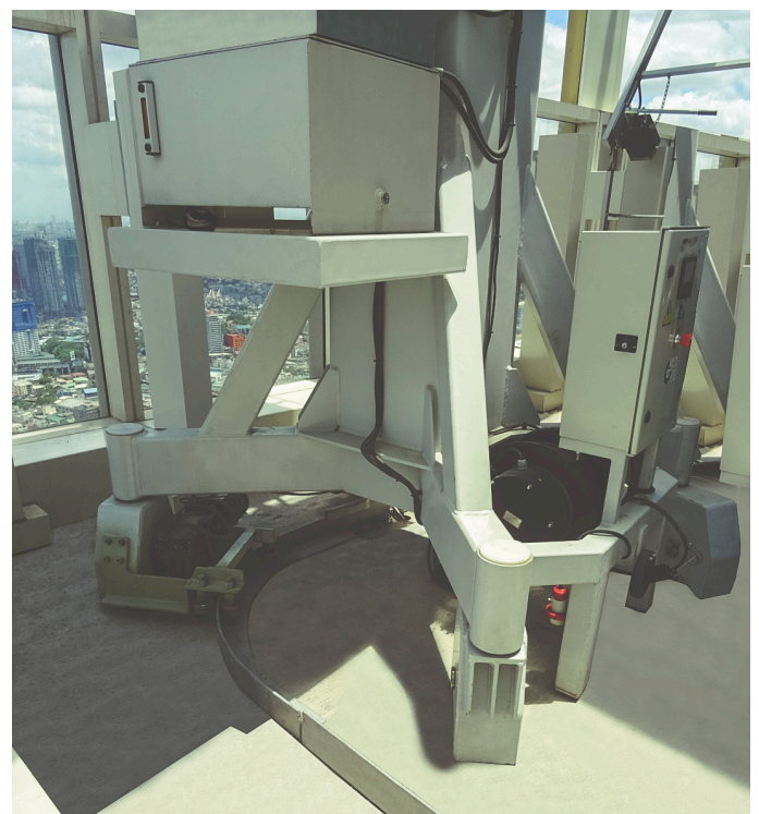
Foldable guide rail system.

200m for the corner platforms of the BMU due to absence of guide rails