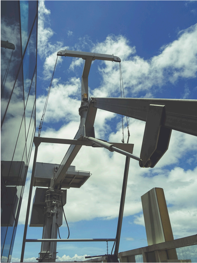
Pantograph system to reach the concealed facade.