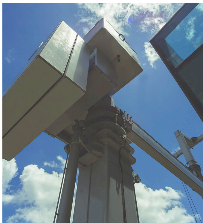
Length reduced counterweight.

Regarding the upper roof deck, which is metallic and inclined, a Securail system from Fallprotec has been installed so that every area is accessible by roof technicians, for for the crown cleaning.