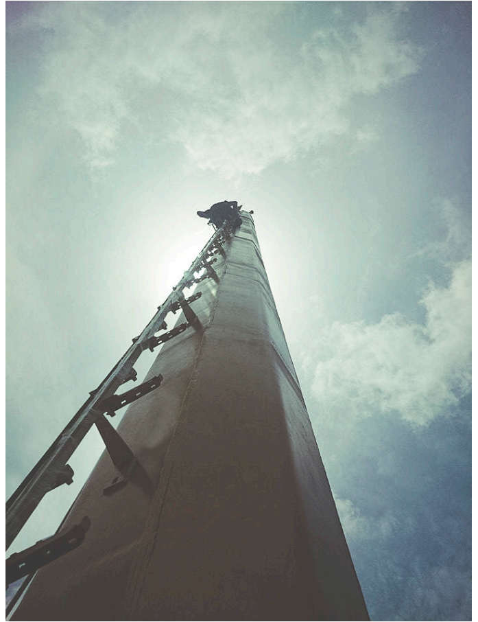
SecuRail ladder for the spire antenna maintenance.